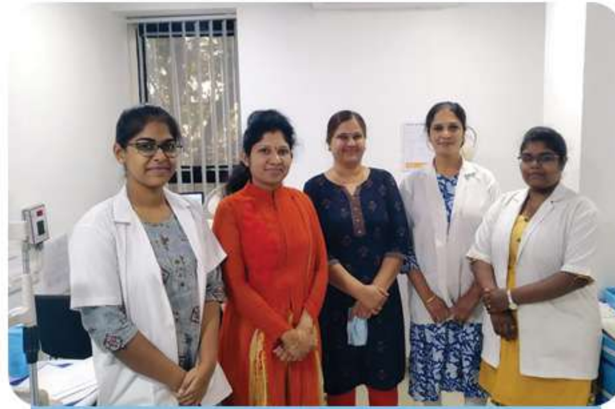
SEH-RS PURAM (CCH)