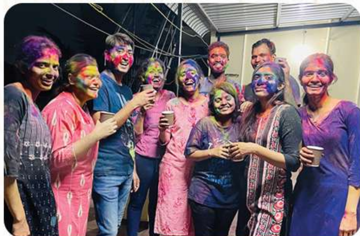
SEH - COIMBATORE